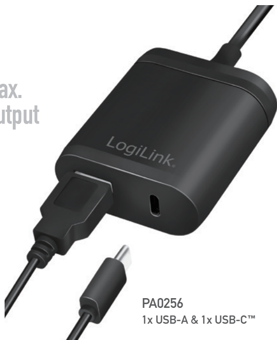
PA0256 1x USB-A & 1x USB-C™