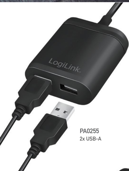
PA0255 2x USB-A